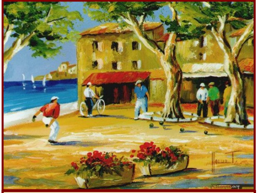
You Are Invited To Our