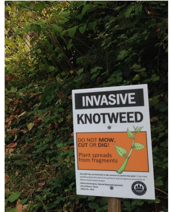
Figure 4. Knotweed sign on North Mercer Way.

The tree risk assessment program's methodical approach to tree risk assessment and mitigation has reduced the amount of tree failures along park edges. This was evident after the February 2017 and February 2019 snowstorms, when staff found very few failures along assessed boundaries.