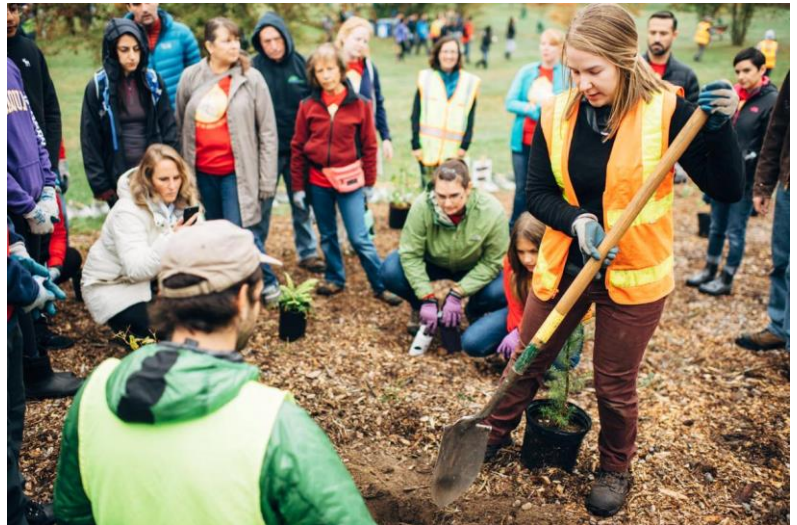
Figure 2. Planting demonstration at Luther Burbank Park

Volunteer forest stewardship continues to be a vibrant component of the Open Space program. In 2017-2018, the City contracted with EarthCorps and Mountains to Sound Greenway (MTSG) to manage 101 events in eight parks. They engaged 3,150 volunteers who worked 11,092 volunteer hours. In addition to EarthCorps and MTSG volunteers, an additional 1,220 volunteer hours were contributed by our local Forest Stewards and 'Friends of' groups who worked independently in their nearby park or hosted neighborhood events. Currently, the Forest Steward Program has stewards working in seven parks.