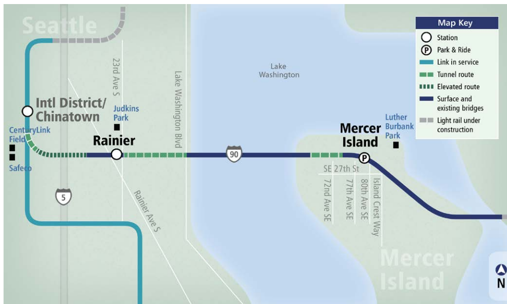
East Link route map

Light rail travels east from Seattle across Lake Washington on the I-90 floating bridge. Light rail serves Mercer Island with a station in the center roadway of I-90. Riders will enter the station at 77th Ave. SE and 80th Ave. SE, in close proximity to the Mercer Island Park-and-Ride lot.