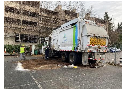
Figure 2. CMI staff respond to hydraulic fluid spill, January 2025

An illicit discharge is defined as any discharge into the stormwater system that is not composed entirely of stormwater or of non-stormwater discharges