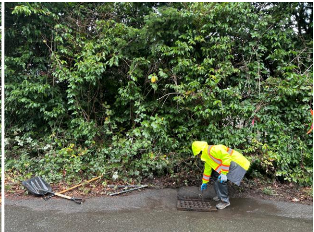
Figure 4. Catch basin after it has been cleared and inspected by CMI staff.