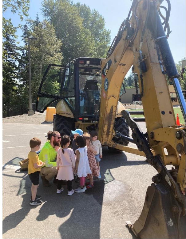
Figure 1. CMI staff attend a school to teach about trucks and their role in city maintenance