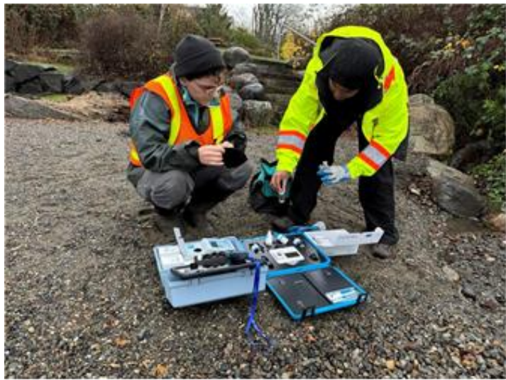
Figure 1. Outfall water quality testing