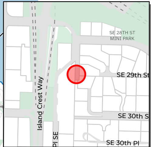
Station B3-D 2835 82ND AVE SE