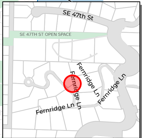
Station E5-F 4753 FERNRIDGE LN